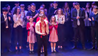
The Oedipus company receiving the audience's applause at the end of the production.